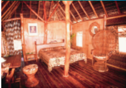
Above: a secluded motu. Below: Kia Ora Sauvage.

Two hundred and thirteen miles northeast of Papeete, and a million miles from the hectic pace of city life, lies the Tuamotu atoll of Rangiroa. Rangiroa boasts the second largest atoll lagoon in the world. The lagoon—all 633 square miles of it—is big enough to fit the entire island of Tahiti inside.